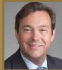
LATHAM LATHAM & WATKINS